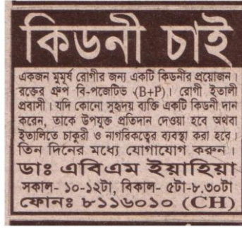
Figure 1. Kidney wanted for an Italian resident The Daily Ittefaq, 25 June 2000